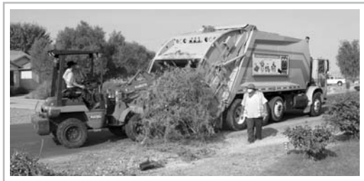
The Public Works Department continued its quarterly collections of bulk trash.