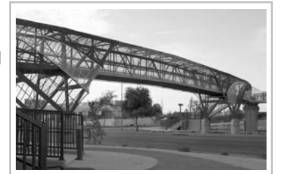
The new Issac Pedestrian Bridge over McDowell Road near 35th Avenue provides a safer way for students and other pedestrians to cross the busy street.

The number of people signed up for P.L.A.N. (Phoenix Legislative Action Network), a Government