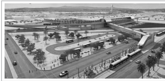
The first phase of the PHX Sky Train at Phoenix International Sky Harbor Airport will shuttle passengers between a METRO light rail stop at Washington and 44th streets, the east parking lot and Terminal 4.

The Development Services Department relocated its data center from City Hall to the Information Technology Operations Center, saving the department the cost of doing electronic backups and providing a redundancy for business continuity and disaster recovery.