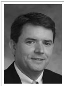
Bill Gates District 3