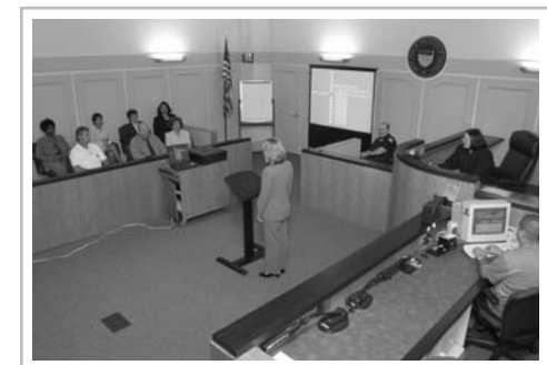
Phoenix Municipal Court processed 98 percent of its civil cases within 120 days, and 96 percent of its criminal cases within 180 days. It also reduced jury trial continuances from 70 percent to less than 25 percent and increased the number of Driving Under the Influence cases resolved at the first trial setting from 20 percent to 70 percent.